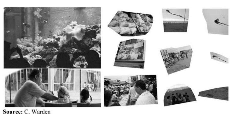
Plate 3. Excerpts from Respondent A and M's summary images related to crowds