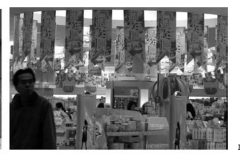
Plate 12. Researchers' field photos showing the reality of marketing communication