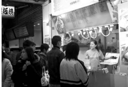
Plate 10. Researchers' field photos showing the reality of common servicescapes